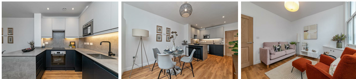
Ground Floor Approx. 360.2 sq. feet

Cassidy & Tate are pleased to present this attractive two bedroom, two reception room end of terrace property, located in the heart of the conservation area with the rare advantage of off road parking. This pretty cottage has a contemporary feel as you step inside with accommodation arranged on two floors. The ground floor comprises living room, cloakroom and a spacious kitchen/diner. To the first floor you will find the two double bedrooms and a trendy bathroom. To the outside is a lovely low maintenance decked garden, with the benefit of rear gated access leading to off-street parking. Victoria Street is conveniently located for ease of access to both the vibrant shopping and leisure facilities of the city centre and a short walk to the mainline railway station linking St Albans to London in approximately 25 minutes.